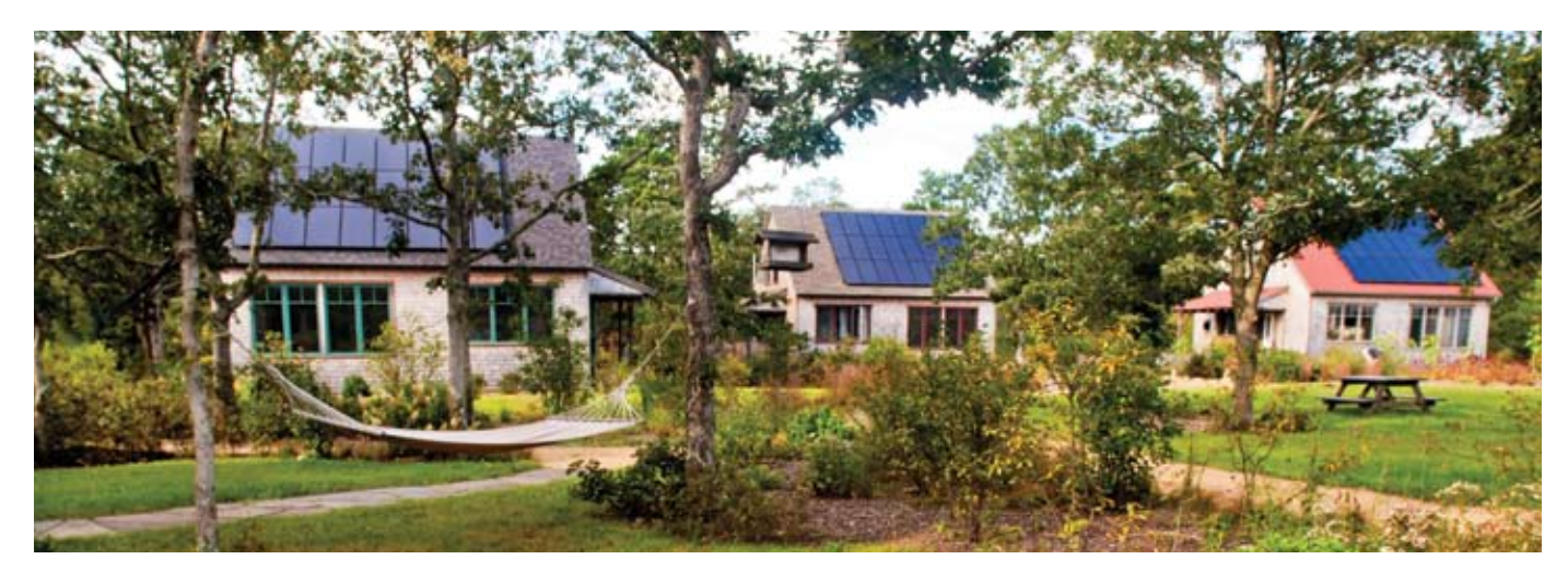
Emily and Paul Galligan, facing, enjoy the communal aspects of life at Eliakim's Way, where eight houses share a central open space and gardens.

here is a feeling among some Vineyarders that land conservation and affordable housing are competing objectives. On the surface, it seems to make sense: The more land set aside for conservation, the less there is available for housing. But on investigation, the facts belie the myth. Land is not expensive because conservation groups are driving up the price, but because wealthy vacationers with disposable incomes are. And affordable housing developments aren't gobbling up land; vacation homes are. In reality, affordable housing and conservation are battling the same economic forces.