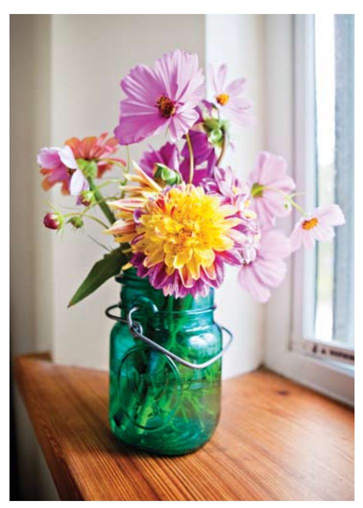
Thick, super-insulated walls are energy-efficient and provide deep sills.

Point in West Tisbury, and Morgan Woods in Edgartown) seek to cluster the buildings and conserve the rest of the land.