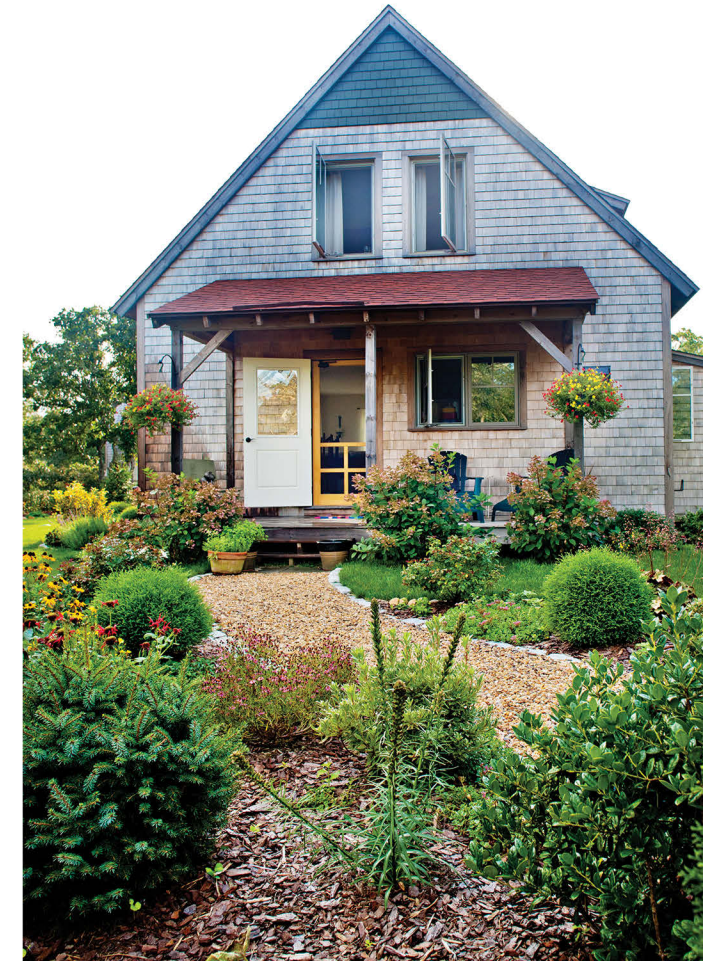
$100,000 Builds a Home Forever

WITH 50 LEADERS, WE CAN REALIZE AT LEAST $5 MILLION THAT WILL LEVERAGE MATCHING TOWN AND STATE FUNDS.