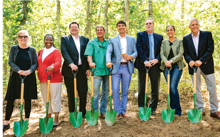
Strong Partnerships Build Great Neighborhoods

Partnering with island towns, the state and private donors we need to raise $6 million annually.