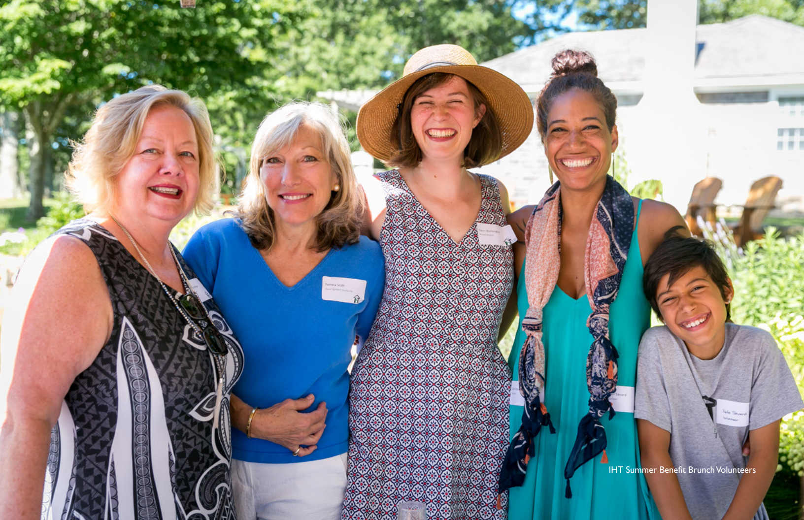
IHT Summer Benefit Brunch Volunteers