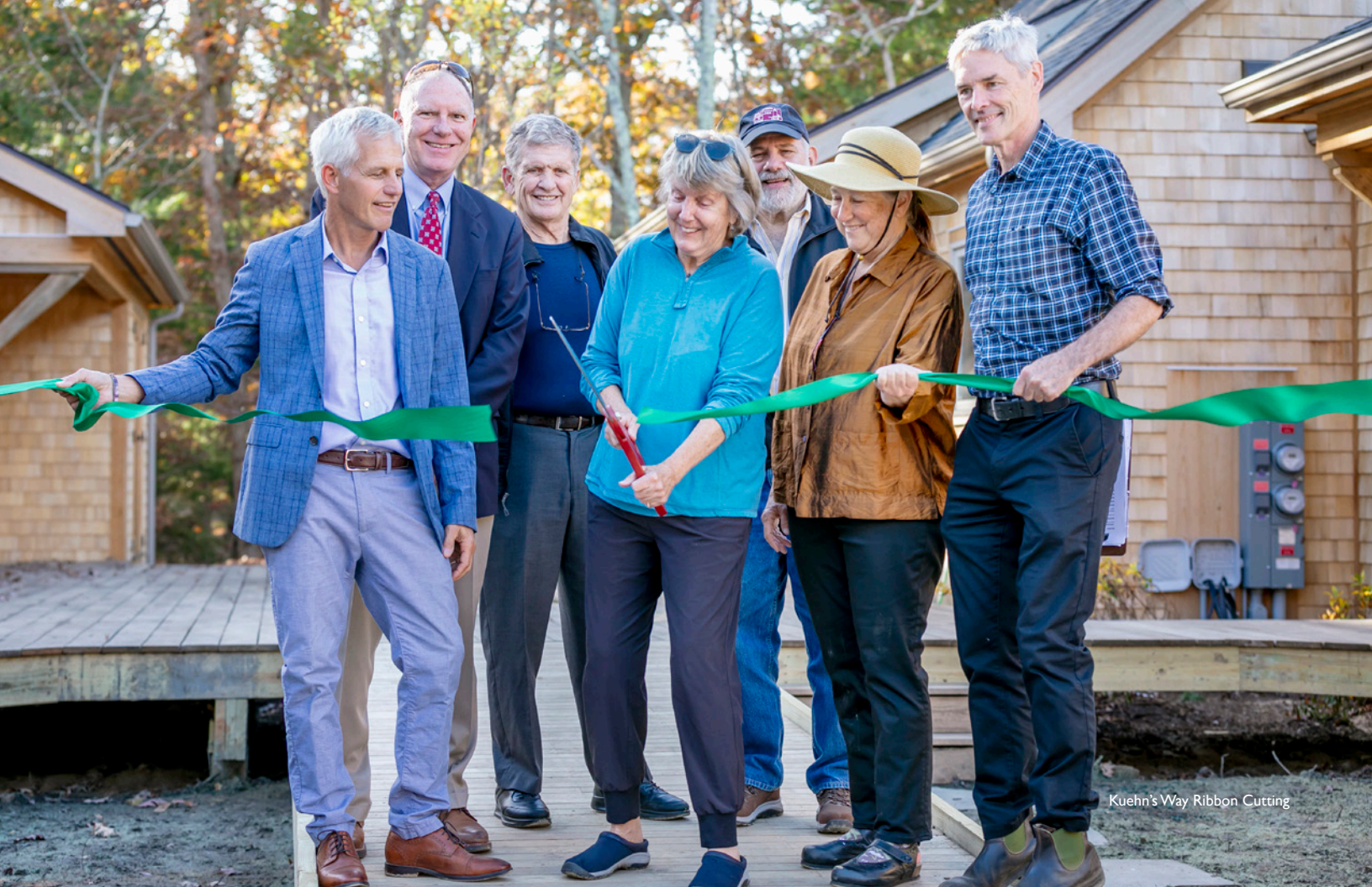
Kuehn's Way Ribbon Cutting